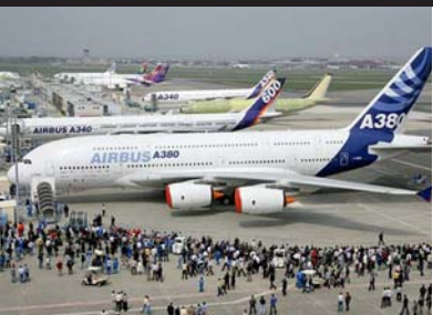
Aerospace and Satellite Imaging