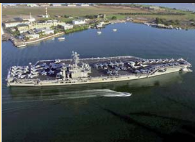
Aeronautics &amp; Naval Architecture