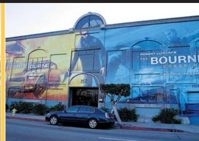
Artwork &amp; Graphics